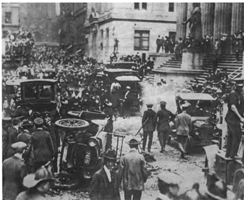
Wall Street bombing, 1920