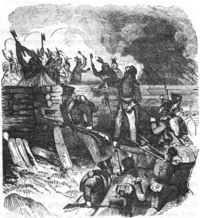
Battle of Tohopeka

As a movement to return to the traditional ways of living, the Creeks had to follow their traditions that demanded the violent deaths of their enemies. While they quickly succumbed to prag-