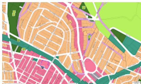
Angelina Apartments CD1.Png 277K